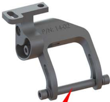
ALUMINUM THREADED INSERT