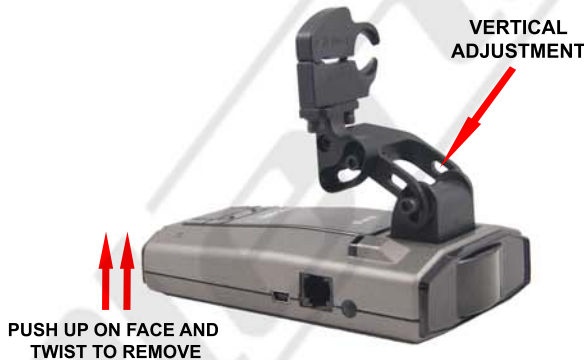
PUSH UP ON FACE AND TWIST TO REMOVE