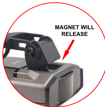
MAGNET WILL RELEASE

6 - Install the RD onto the mount. Make necessary adjustments using the upper and lower pivots, and the vertical adjustment. Leave enough room below bottom of mirror to allow access to top radar detector buttons. To remove the radar from the magnetic mount, simply tilt the face of the RD up and twist slightly to side, then the magnet will release.